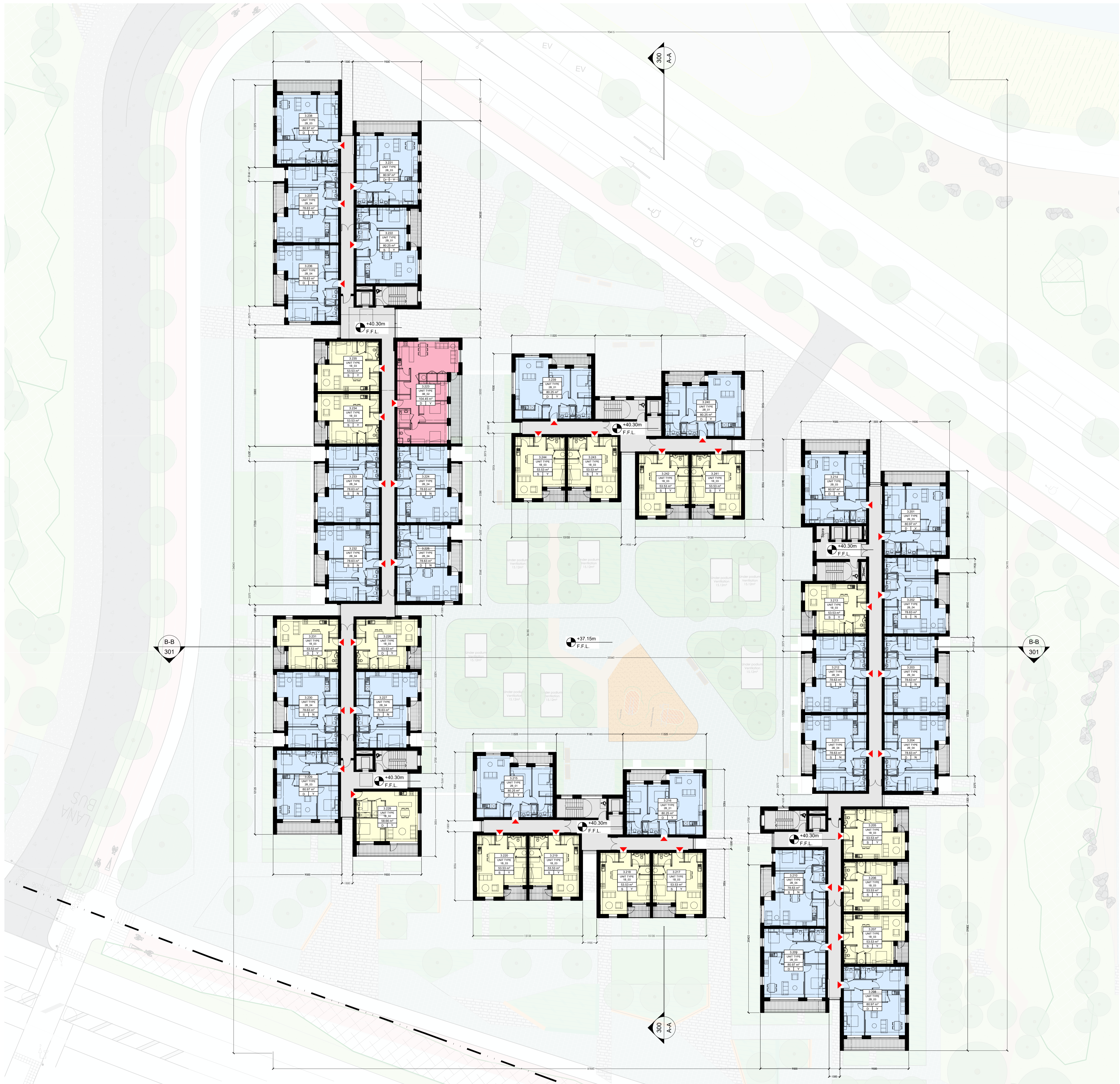
2nd Floor Plan - Block 3 Scale 1:200 @A0